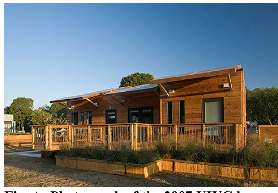
Fig. A: Photograph of the 2007 UIUC house.

The Illinois entry to the competition will consist of an interdisciplinary collaboration between three of our colleges; ACES, FAA, and Engineering (CoE). In addition, we expect involvement of students from Communications and Business. While successfully integrating all these different disciplines is difficult, it is feasible and extremely effective. The 2007 team consisted of over one hundred students and involved faculty members from at least six different academic apartments. We have continued this tradition, building on the success of the past and improving for the future.