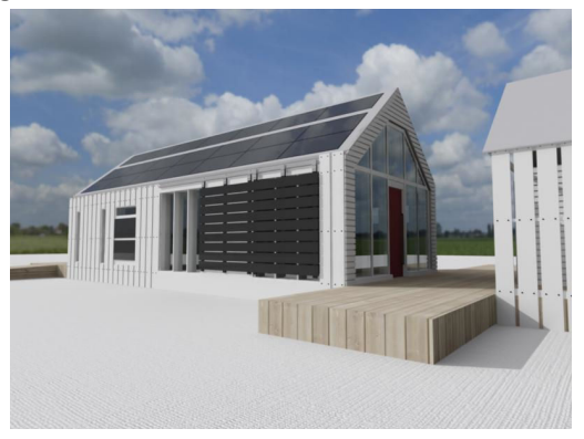
Fig B: Rendering of 2009 House – Cam Greenlee