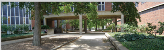
Burrill / Morrill / Medical Sciences Corridor