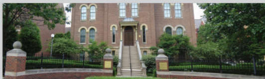
Harker Hall: University of Illinois Foundation