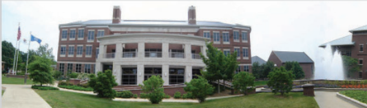
Alice Campbell Alumni Center