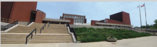
Krannert Center for Performing Arts