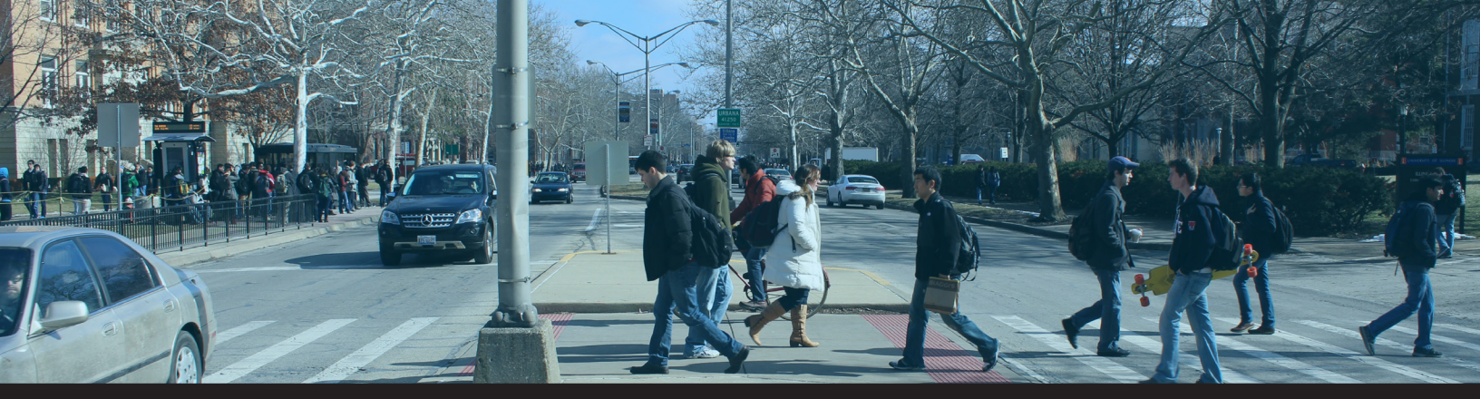
Project updates at: MCOREProject.com