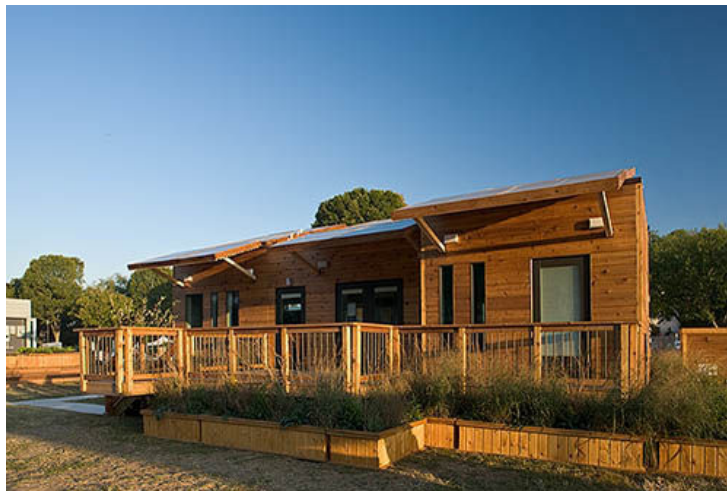
Fig. A: Photograph of the 2007 UIUC house.

The Illinois entry to the competition will consist of an interdisciplinary collaboration between three of our colleges; ACES, FAA, and Engineering (CoE). In addition, we expect involvement of students from Communications and Business. While successfully integrating all these different disciplines is difficult, it is feasible and extremely effective. The 2007 team consisted of over one hundred students and involved faculty members from at least six different academic departments. We hope to continue this tradition, building on the success of the past and improving for the future. With greater experience, recognition, planning, and coordination, a great result can be achieved.