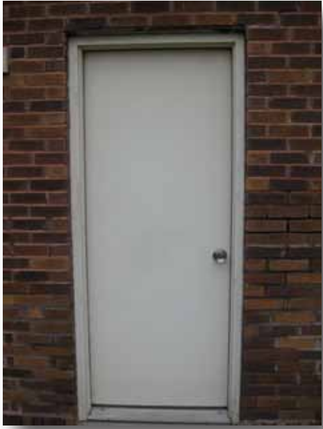
Basement door requiring caulk and tuck pointing