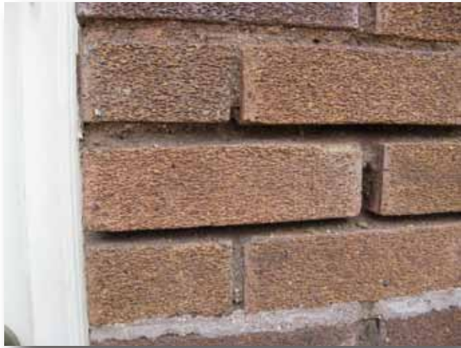
Close up of required tuck pointing areas