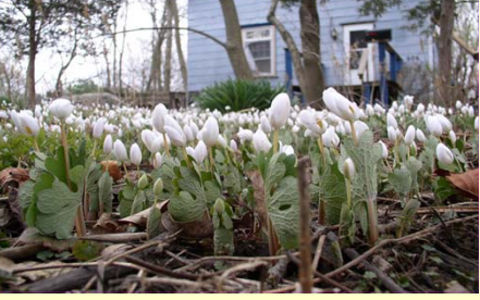
and the buds will open. Bloodroot stays green until fall.