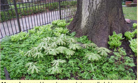
berries, which turn yellow when ripe