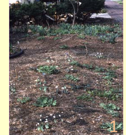
The progression of wildflowers from early March through June is shown in these three photos of the same yard. Bloodroot (photo 1) is among the earliest-blooming wildflowers and goes well with tulips and daffodils. Bluebells and celandine poppy (2) bloom next. Wild geraniums (3), columbine, and a variety of other species bloom through May.