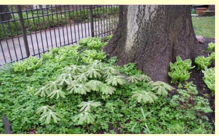
Mayapples spread by underground stems called rhizomes and typically form clusters. They have large white flowers under their umbrella-shaped leaves. Their seeds are in plum-sized