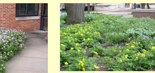
This woodland wildflower planting is on the University of Illinois campus. In bloom are celandine poppy, Trillium recurvatum, bluebell, Jacob's ladder, mayapple, and some violets.