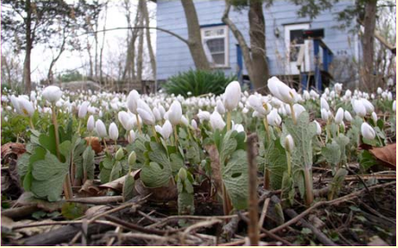
Bloodroot covers this shady yard. The leaves will soon unfurl