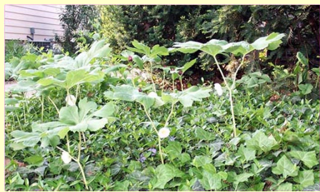
Many woodland wildflowers are on stalks which rise above lower vegetation. Here, mayapples and Trillium co-exist with ornamental groundcover. Other examples include Solomon's seal, bluebells, and jack-in-the-pulpit