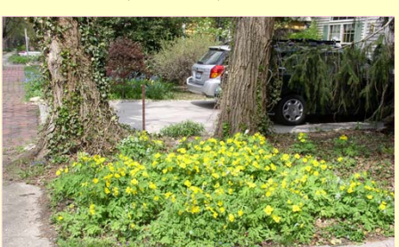
Celandine poppy can form dense patches. This plot has sustained itself for over 25 years with little maintenance in an Urbana yard. This plant stays green until fall and sometimes