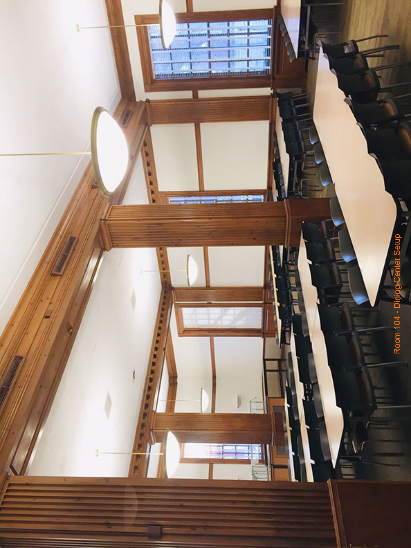
Room 104 - Dining Center Setup