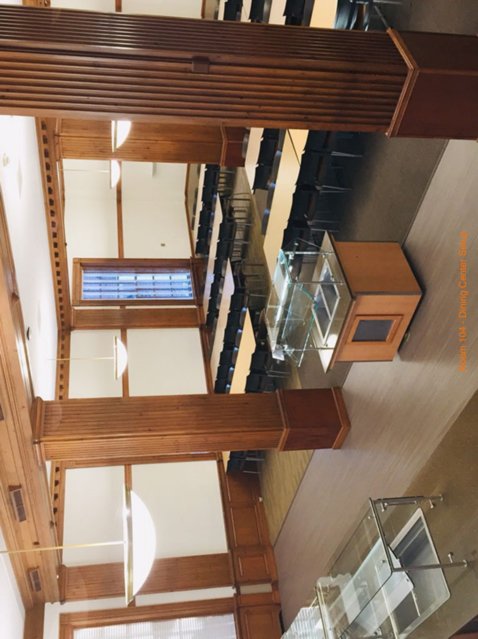
Room 104 - Dining Center Setup