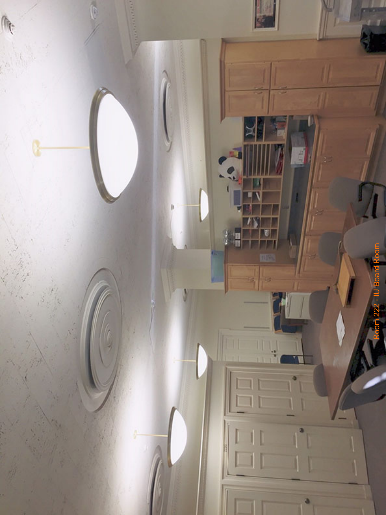
Room 222 - IU Board Room