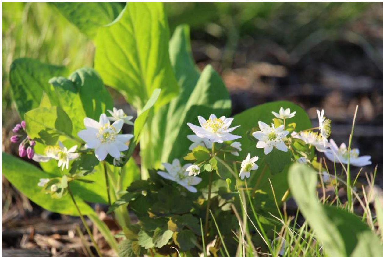
Rue Anemone in bloom at the Red Oak Rain Garden.