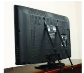
Flat-Panel TV (rear view)

Pickup of TV from your home when a replacement TV is delivered by Geek Squad® or by Best Buy Home Delivery is $19.99.