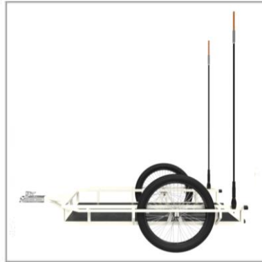
COASTER VENTURE TRAILER

Designed for performance, the Venture is a light and maneuverable ECT with efficient cargo capacity and a top-loading cargo box.