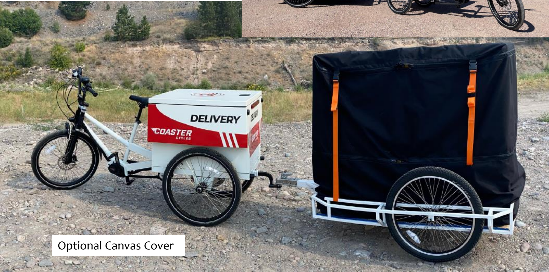
Optional Canvas Cover