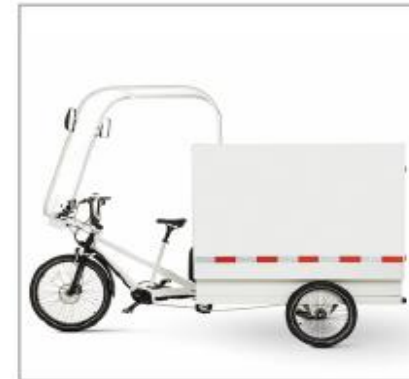
COASTER FREIGHTER AW

The Venture Trailer quickly adds capacity to the Venture. Designed with a standard ball-style hitch, attaching the Venture Trailer is quick and convenient.