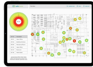
Bullseye visualization shows detection level for each tracer tested at a sample point