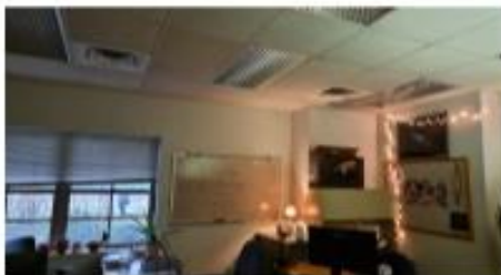
Acoustical Tile Ceiling - typical