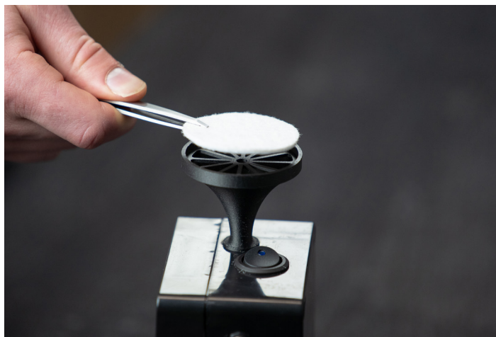
The average vacuum flow rate for the air sampler simulates inhalation

1. Chemical Composition: veriDART's tracers mimic the chemical composition of human saliva and aerosols. Tracers consist of distilled water, food-grade, water-soluble ingredients, and DNA. veriDART adheres to the highest levels of product safety. The FDA confirmed Generally Recognized as Safe (GRAS) status for our technology, which uses short, non-coding, non-living DNA sequences. veriDART complies with OSHA, NIOSH, and ECHA safe exposure limits.